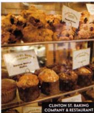
CLINTON ST. BAKING COMPANY & RESTAURANT